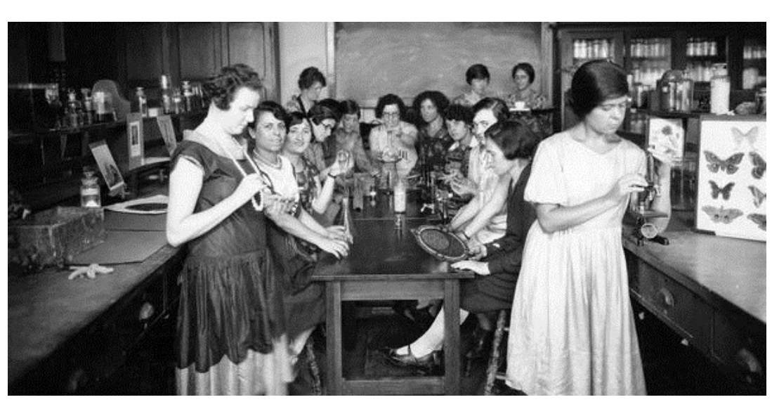
A photo of a science class at Barnard in 1928

1.Department of Environmental Protection. (2019, May 17). Water Consumption In The New York City: NYC Open Data. Retrieved from https://data.cityofnewyork.us/Environment/Water-Consumption-In-The-New-York-City/ia2d-e54m.